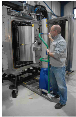
Figure 2. The 750mm diameter drum for coating onto polymer (or metal) sheet is loaded into a two-door CFM1050. The machine is equipped with eight 1.2m linear magnetrons (with four in each door).

Systems from Applied Multilayers offer a number of important advantages for process R&D for thin film photovoltaics: