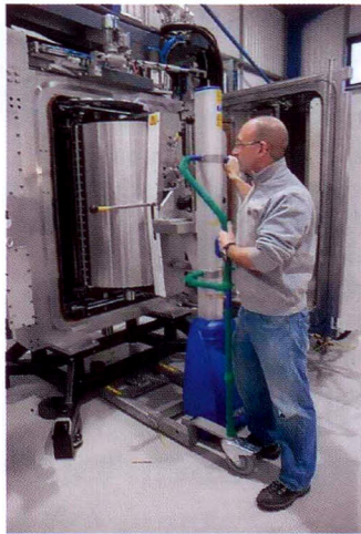
CFM1050 is equipped with 8 1.2m magnetrons.

• The rotating drum substrate carrier allows up to eight linear magnetrons to be located around the